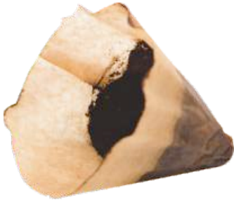
Coffee & Filters Café & Filtros

Please place all organic items in the organics cart or bin. Por favor coloque todos los artículos orgánicos en el bote o contenedor orgánicos.