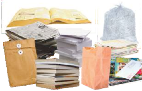
Paper: El Papel