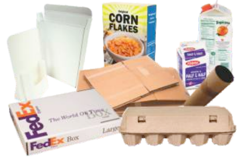
Cardboard Unwaxed & flattened Cartón Sin cera y aplanado