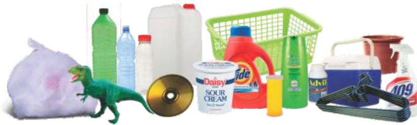
Plastic & Film Plástico y Película de Plástico