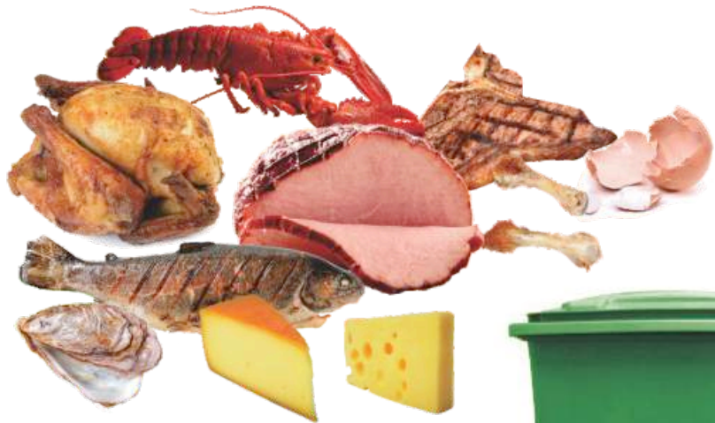
Dairy & Cooked Meats Lácteos & Carne Cocinada