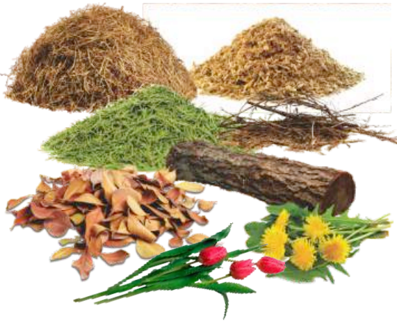
Yard Trimmings Recortes de Jardín