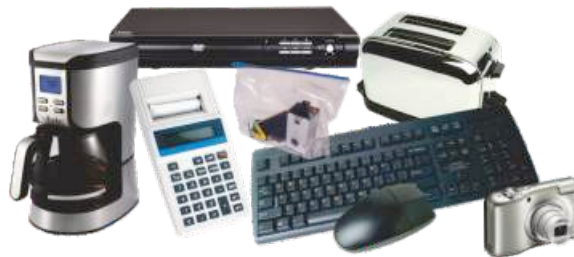
Small Electronic Waste Desperdicios Pequeños Electrónicos