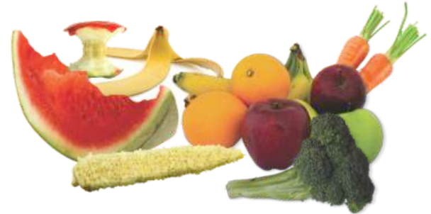
Fruits & Vegetables Frutas & Verduras