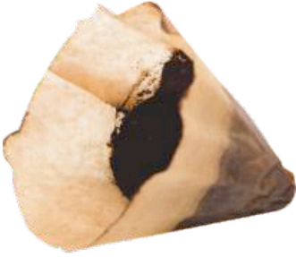
Coffee & Filters Café & Filtros

Please place all organic items in the organics cart or bin. Por favor coloque todos los artículos orgánicos en el bote o contenedor orgánicos.