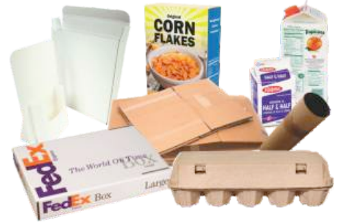
Cardboard Unwaxed & flattened Cartón Sin cera y aplanado