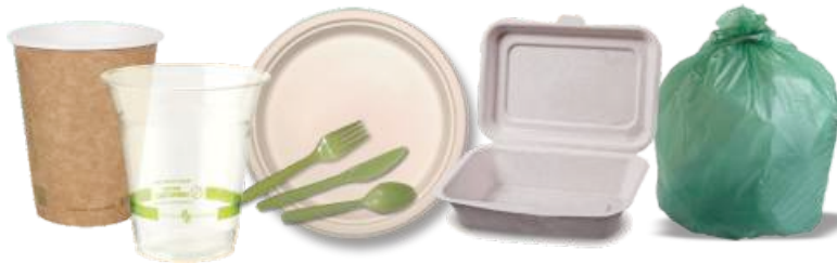
Compostable Food Wares Productos de comida compostables

NOTE: BPI Certified compostable food ware allowed for businesses ONLY.