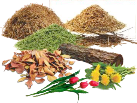
Yard Trimmings Recortes de Jardín