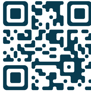
Scan to view F.O.G Ad

Santa Cruz County's Fats, Oils & Grease (F.O.G) campaign strives to minimize the disposal of F.O.G down drains. After approximately 20 years, we updated our holiday F.O.G ad video with a new targeted campaign that ran on KSBW and over-the-top online streaming services from November 2023 through December 2023. This ad targeted specific zip codes found to have excessive F.O.G.